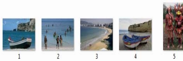
Fig. 3. Images retrieved using Walshlet and Walsh transforms with Sobel operator