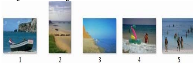
Fig. 4. Images retrieved using Walsh wavelet with Sobel operator

Shown below in Fig. 5 are the bar graphs of the precision values obtained for six query images Img1, Img2, Img3, Img4, Img5 and Img6, using Walshlet, Walsh and Wash Wavelet transforms with Sobel operator.