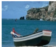
Fig. 2. Query image

For the query image shown in Fig. 2, the first five images retrieved for this query using Walshlet, Walsh transform and Walsh wavelet with Sobel edge detector are shown in Figs 3 and 4 respectively.