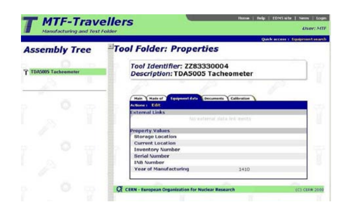
Fig. 3. The equipment data tab